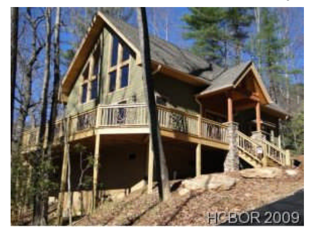
Driveway is paved