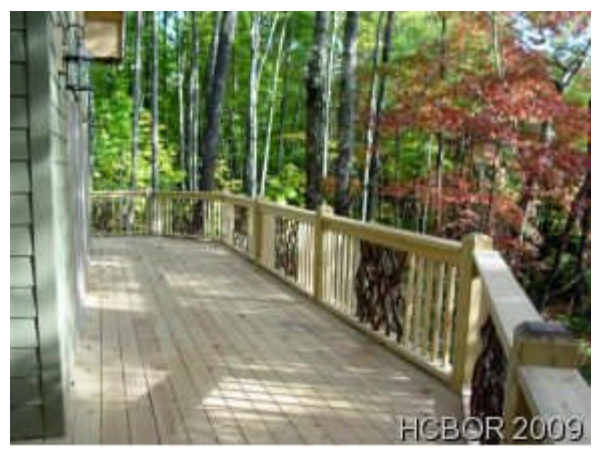
Plenty of decks!