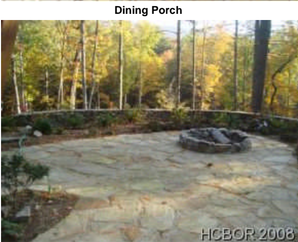
Stone Patio wfire ring