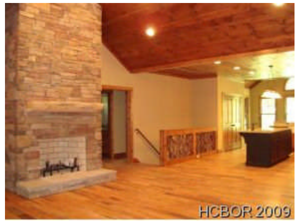
Living room will be similar