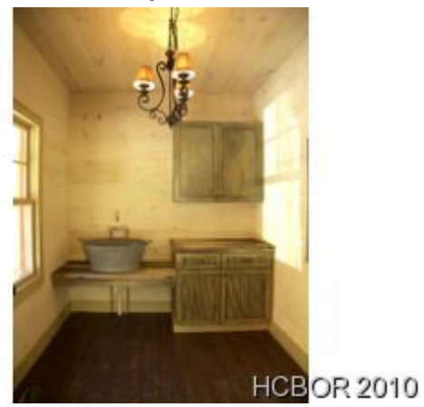
Exterior Potting Room wSink