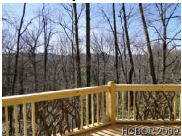
Great Mountain Winter Views