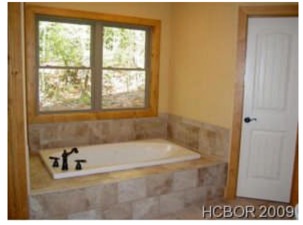
Master Bath whisher closets