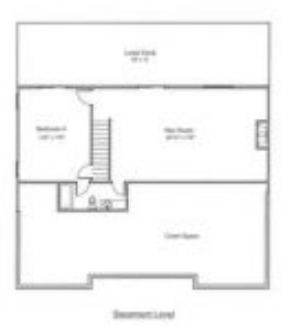
HCBOR 2009 Basement level floorplan