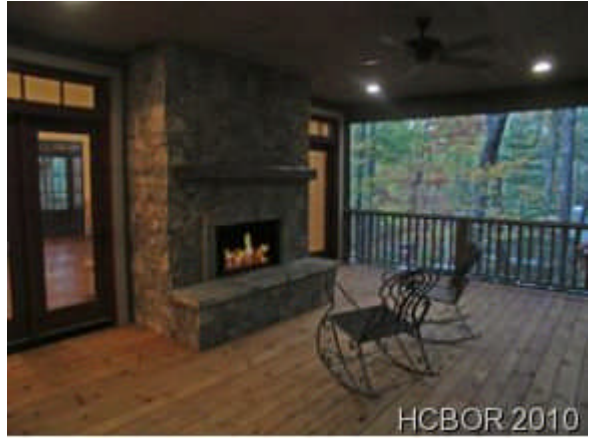
Rear Screened DeckFire Place