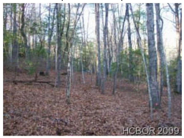
Over 1 acre of property