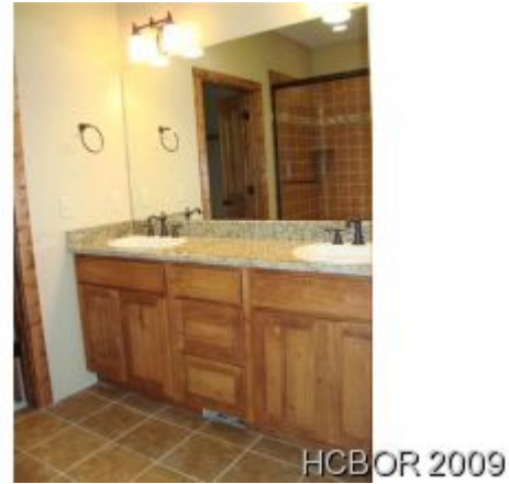
Master bath will be similar