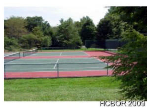
Sapphire Amenities- Tennis