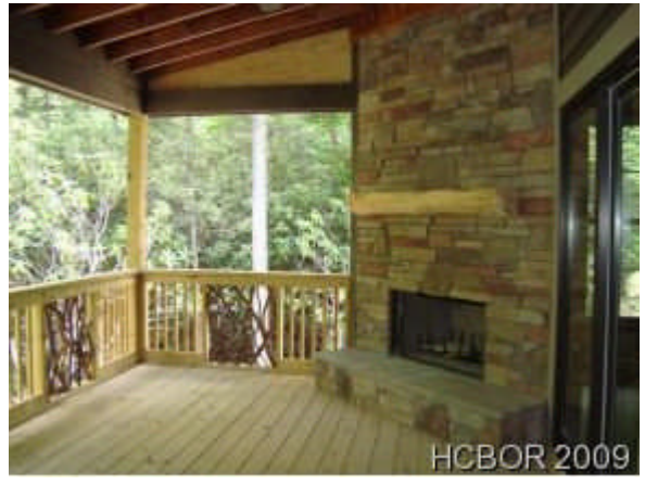
Rear porch will have fireplace