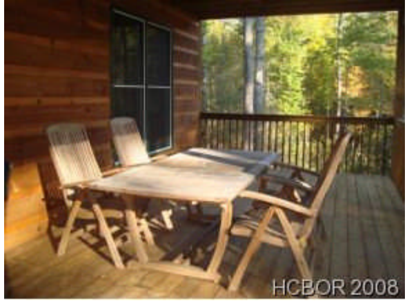
Covered Patio on Lower Level