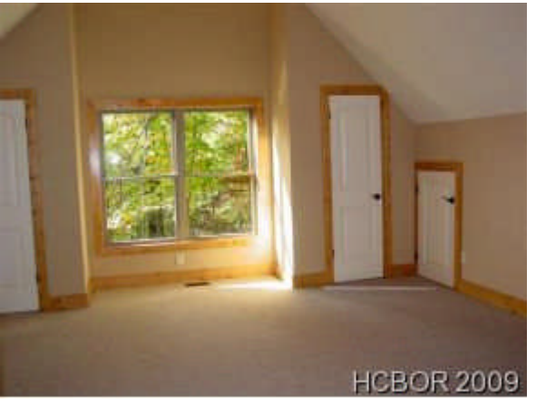
2 Large Guest Rooms