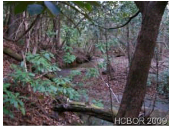
Creek meanders along back line