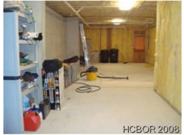
Large Storage Room