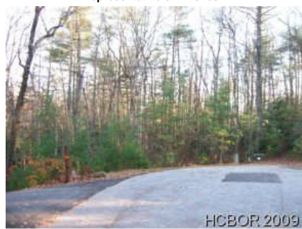
Private cul-de-sac location