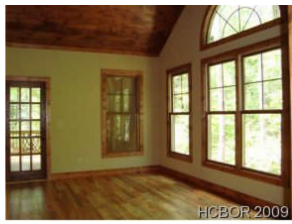
representative of finishes